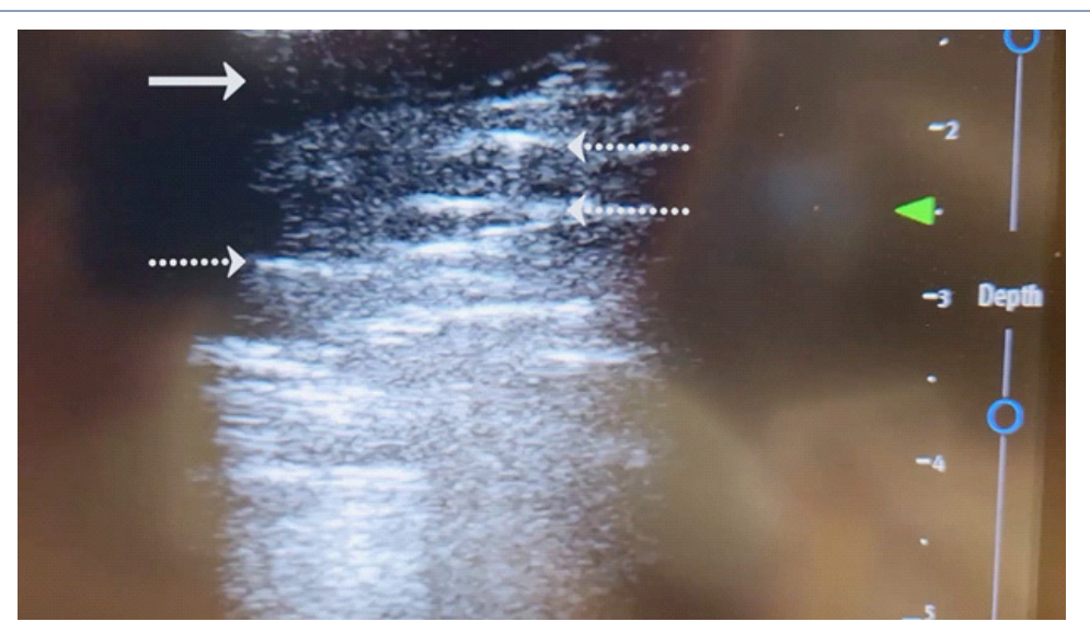
Figure 2: Point-of-care ultrasound video of left lung. Solid arrow indicates a small pleural effusion. Perforated arrows indicate dynamic air bronchograms, which differentiate pneumonia from atelectasis.