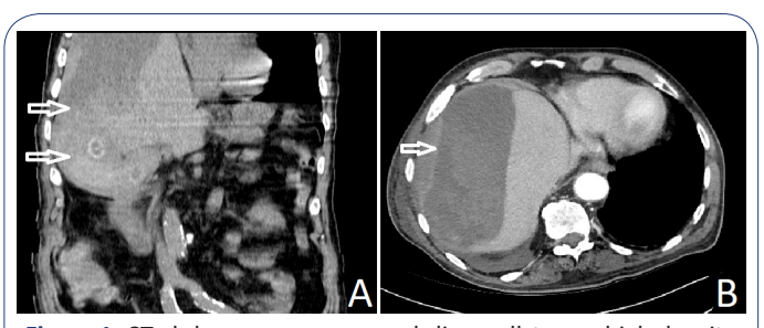
Figure 1: CT abdomen, same coronal slice, gallstones, high density fluid in the gallbladder and image of intrahepatic subcapsular hematoma (A) and transvers slice, image of intrahepatic subcapsular hematoma (B) .

In the radiological follow-up, there wasn't an increase in the size of the intrahepatic subcapsular hematoma of the patient. We didn't see free fluid in the abdomen. In laboratory tests, the hemoglobin amount of the patient did not decrease. We decided on medical follow-up due to the patient's stable hemodynamics and the presence of many comorbid diseases. On the 5<sup>th</sup> day of follow-up, atrial fibrillation with rapid ventricular response and pleural effusion occurred. On the 7<sup>th</sup> day of follow-up, we intubated and transferred the patient to the intensive care unit. During the follow-up of the patient, we scanned 3 CT and 3 USG images. We didn't see an increase in hematoma size in any of them (Figure 2). Despite all efforts, we could not cure the patient's respiratory problems. The patient died in intensive care on the 23<sup>rd</sup> day of follow-up.