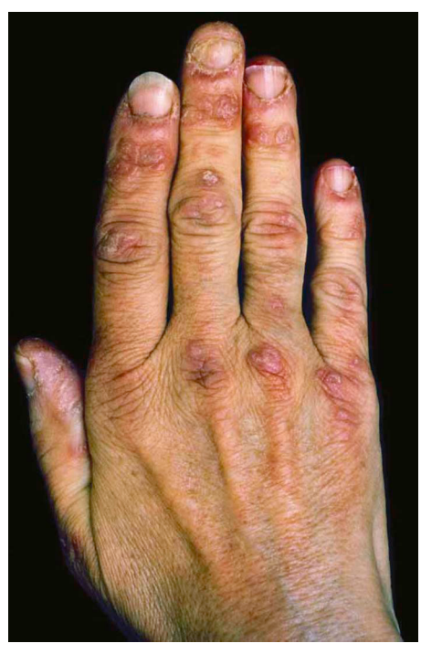
Figure 1: Patient's hand showing red and dusky purple plaques after cold exposure.

Citation: Mahboob Ali MS. Chilblain lupus erythematous- A rare encounter. Open J Clin Med Images. 2023; 3(1): 1111.