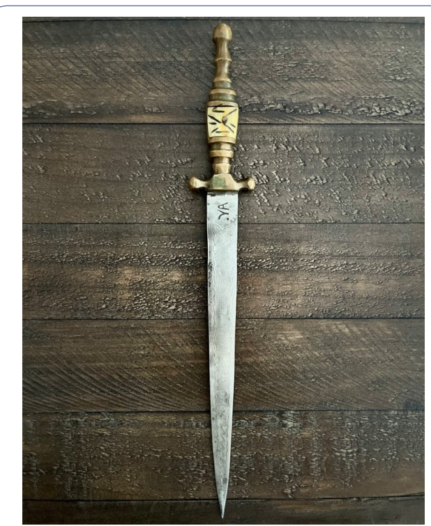
Figure 1: Steel dagger with handle of brass and wood.

The dagger sign tends to be a late finding in ankylosing spondylitis, and it is common to see other classic signs of ankylosing spondylitis in conjunction with it. The "bamboo" sign gives the spine a bamboo-like shape when syndesmophytes form on the annulus puplosis [4]. Romanus lesions are erosion of the corner of the annulus fibrosis near vertebral endplates, which may subsequently sclerose and give a "shiny corner" appearance.