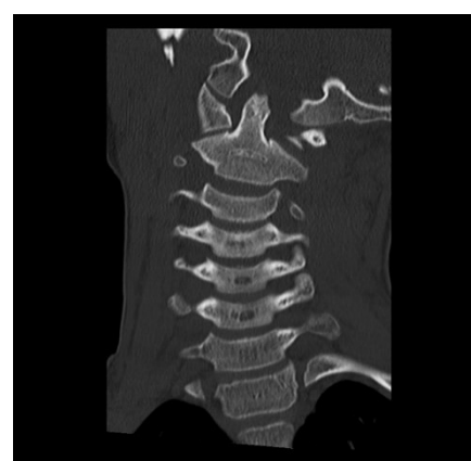
Figure 1B: Initial coronal CT reformatted image (B) demonstrates abnormal offset of the lateral masses of C1 and C2.

Citation: Saenz S, Wong J, Percy S, Monoky DJ, Mazzola CA. Atlantoaxial subluxation of the C1/C2 vertebrae in the pediatric patient: A case study. Open J Clin Med Images. 2022; 2(1): 1050.