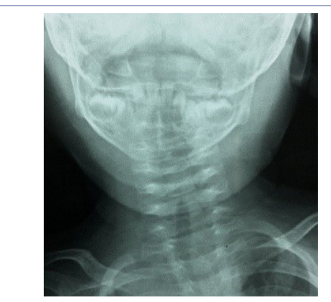
Figure 1A: Initial AP cervical spine radiograph (A) demonstrates dextroconvex rotational deformity of the cervical spine.The C1-C2 levels, however, are obscured by the patient's overlying mandible.

On examination in the office, the child was well developed and in mild distress. He had already been placed in a cervical collar by his pediatrician. The patient was unable to turn his head to the left, fixed in a "cock-robin" position (head rotated and flexed, with associated contralateral head tilt). The remainder of his physical and neurological examinations were unremarkable.