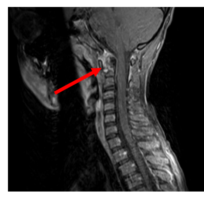
Figure 1E: Sagittal post contrast fat saturated T1 weighted sequence (E) demonstrates abnormal enhancement of the atlantoaxial ligaments including the atlantooccipital membrane, and alar and transverse ligaments due to inflammatory hyperemia ( red ar row ).

Atlantoaxial rotary subluxation (AARS) is a common cervical