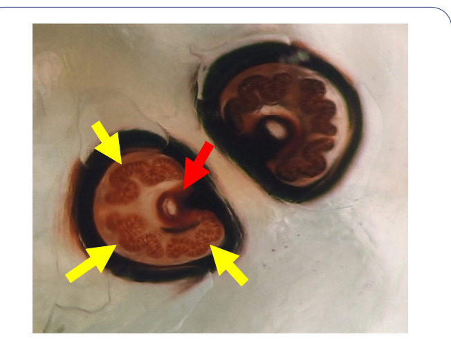
Figure 3: The posterior end of the larva showing: Pair of brown 'D' shaped respiratory spiracles, a chitinised ring (red arrow) and 3 sinuous 'm' shaped stigmatic slits on each spiracle (yellow arrows).

Based on Zumpt criteria, the larval specimens were identified Musca domestica larval stage L3. They are creamy-white cylindrical larvae measuring 8 mm (Figure 1). The anterior end of the larva was tapered and contained one pair of hooks (Figure 2). The posterior end was broad and flatened with respiratory spiracles which have three sinuous slits surrounded by a heavily sclerotized ring with a conspicuous perforated button (Figure 3).