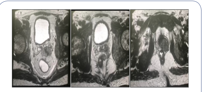
Figure 1: Pelvic MRI demonstrating a lesion centered on the left side of the prostate, showing signs of posterior extension to the ipsilateral seminal vesicle, with a malignant appearance. Lymph node enlargement and bone lesions suspicious for metastasis.

Imaging exams demonstrated alterations in the breast, prostate, seminal vesicles, testis, liver, lungs, spine and lymph nodes. The MRI of the pelvis stands out, with extensive prostate damage, with lymph node enlargement, in addition to multiple bone lesions suggestive of metastasis (Figure 1).